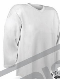
STYLE HOCKEY SINGLE-PLY REVERSIBLE V-NECK JERSEY FABRIC(S) FUSION MESH FIT TRADITIONAL