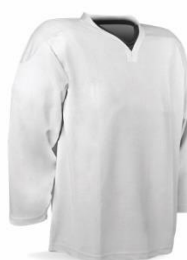
STYLE HOCKEY JERSEY WITH KEYHOLE NECK FABRIC(S) FUSION MESH, CLASSIC, BIRDS EYE MESH, OR BLINK MESH FIT TRADITIONAL