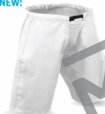
STYLE HOCKEY SHELL FABRIC(S) RIGID WARP FIT TRADITIONAL