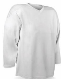
STYLE HOCKEY V-NECK JERSEY FABRIC(S) FUSION MESH, CLASSIC, BIRDS EYE MESH, OR BLINK MESH FIT TRADITIONAL