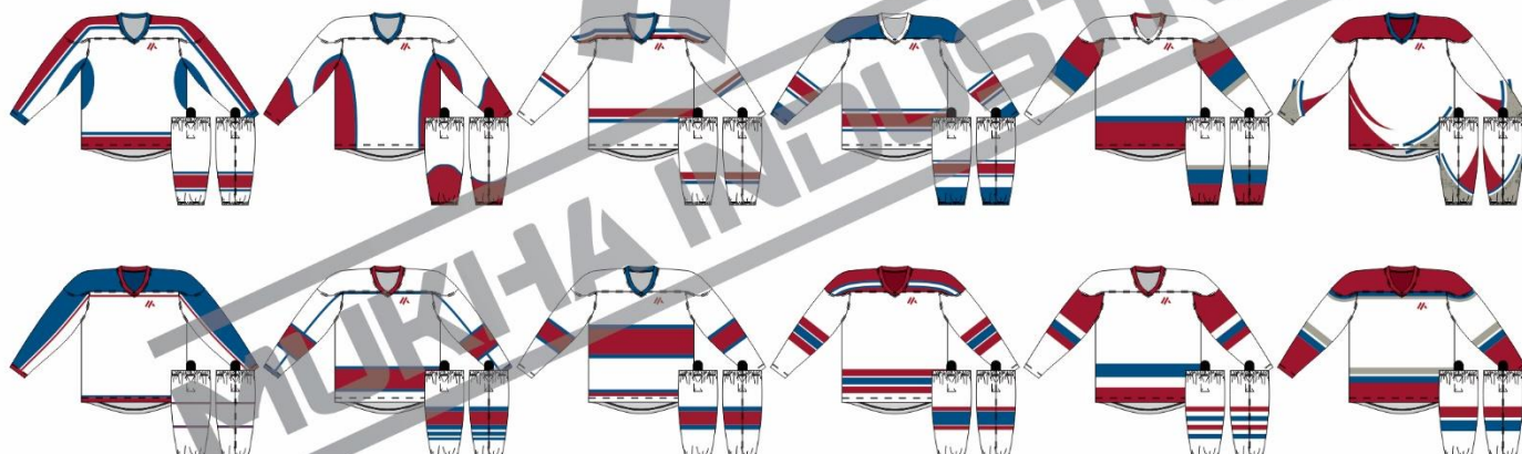
STYLE SINGLE-PLY REVERSIBLE HOCKEY SOCKS ADULT S/M (28" LENGTH), L/XL (30" LENGTH) YOUTH XS (19" LENGTH), S/M (22" LENGTH), L/XL (25" LENGTH) FABRIC(S) FUSION MESH FIT TRADITIONAL