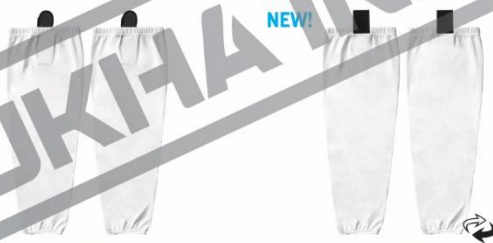
STYLE HOCKEY SOCKS ADULT S/M (28" LENGTH), L/XL (30" LENGTH) YOUTH XS (19" LENGTH), S/M (22" LENGTH), L/XL (25" LENGTH) FABRIC(S) FUSION MESH, CLASSIC, BIRDS EYE MESH, OR BLINK MESH FIT TRADITIONAL