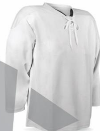
STYLE HOCKEY JERSEY WITH LACE NECK FABRIC(S) FUSION MESH, CLASSIC, BIRDS EYE MESH, OR BLINK MESH FIT TRADITIONAL